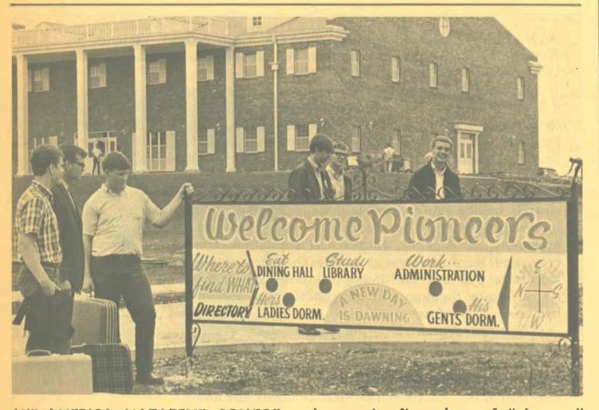
MID-AMERICA NAZARENE COLLEGE welcomes its first class of "pioneers" with a directory in front of the combination library and classroom building. As of September 20, 268 freshmen had enrolled as the student body of the new college.

• an amplified phone call to one of their servicemen, the whole con-